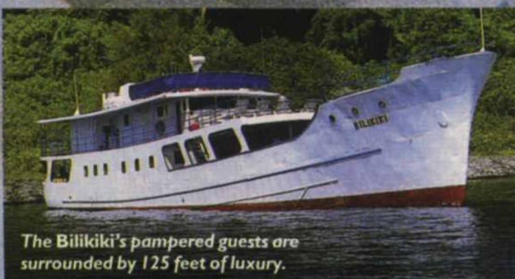
The Bilikiki's pampered guests are surrounded by 125 feet of luxury.

A Spine-cheek Anemonefish ( Premnas biaculeatus ) retreats to the safety of its host anemone.