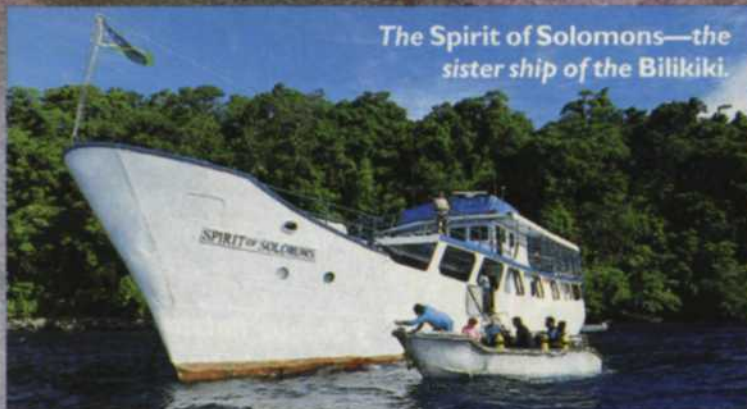
The Spirit of Solomons—the sister ship of the Bilikiki.